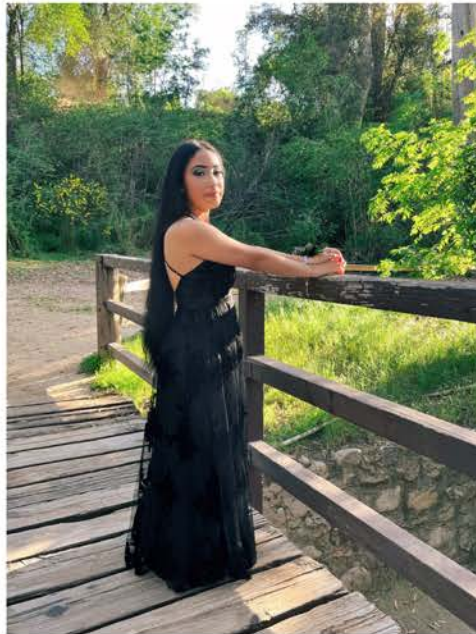
2023 Senior Prom.